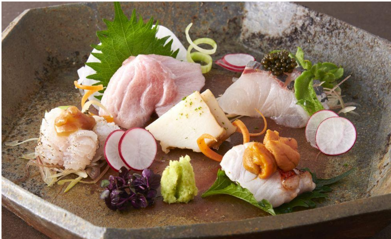
Wagokoro by Hide Yamamoto