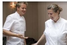
Gordon Ramsay Opens New Hotel "York & Albany"