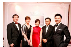
New VISA Insignia Infinite Card for Super Affluent Singaporeans