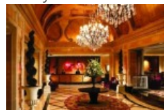
Langham Hong Kong Opening The Langham Club