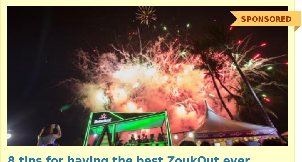
8 tips for having the best ZoukOut ever