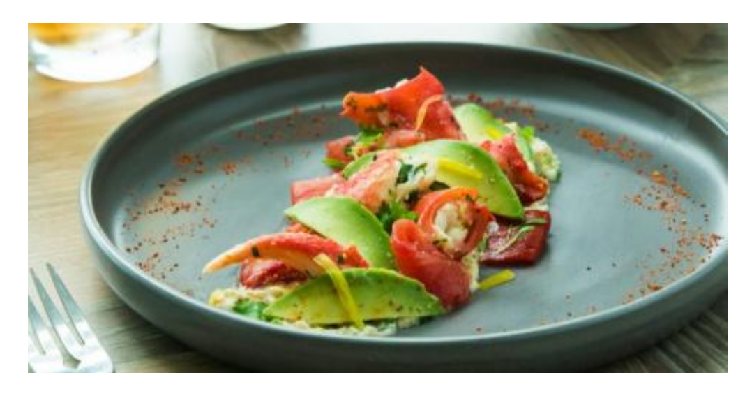
10 exciting new places to eat at in Singapore this December