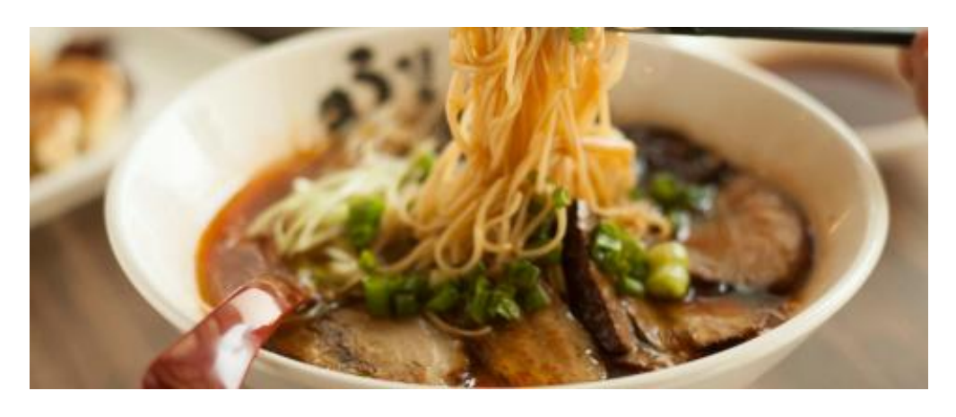
10 of the best ramen places in Singapore