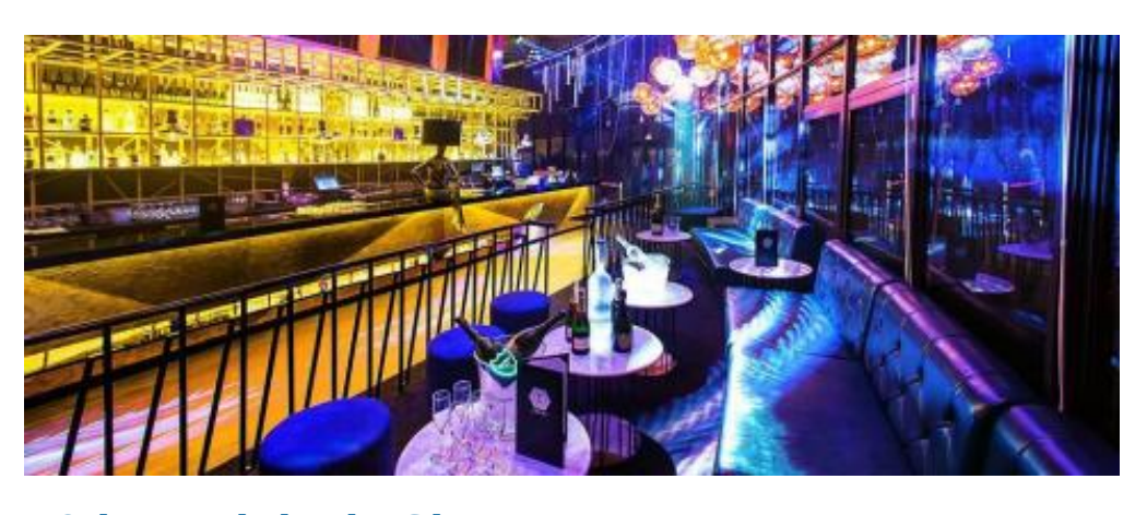
10 best clubs in Singapore