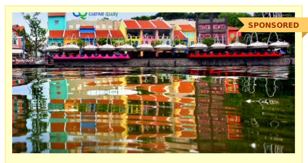
5 great reasons to brunch at Clarke Quay this weekend