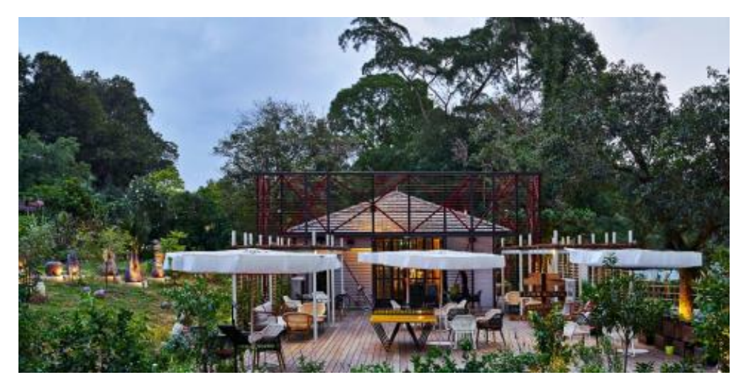
5 fun markets in Singapore to head to in the next two weeks