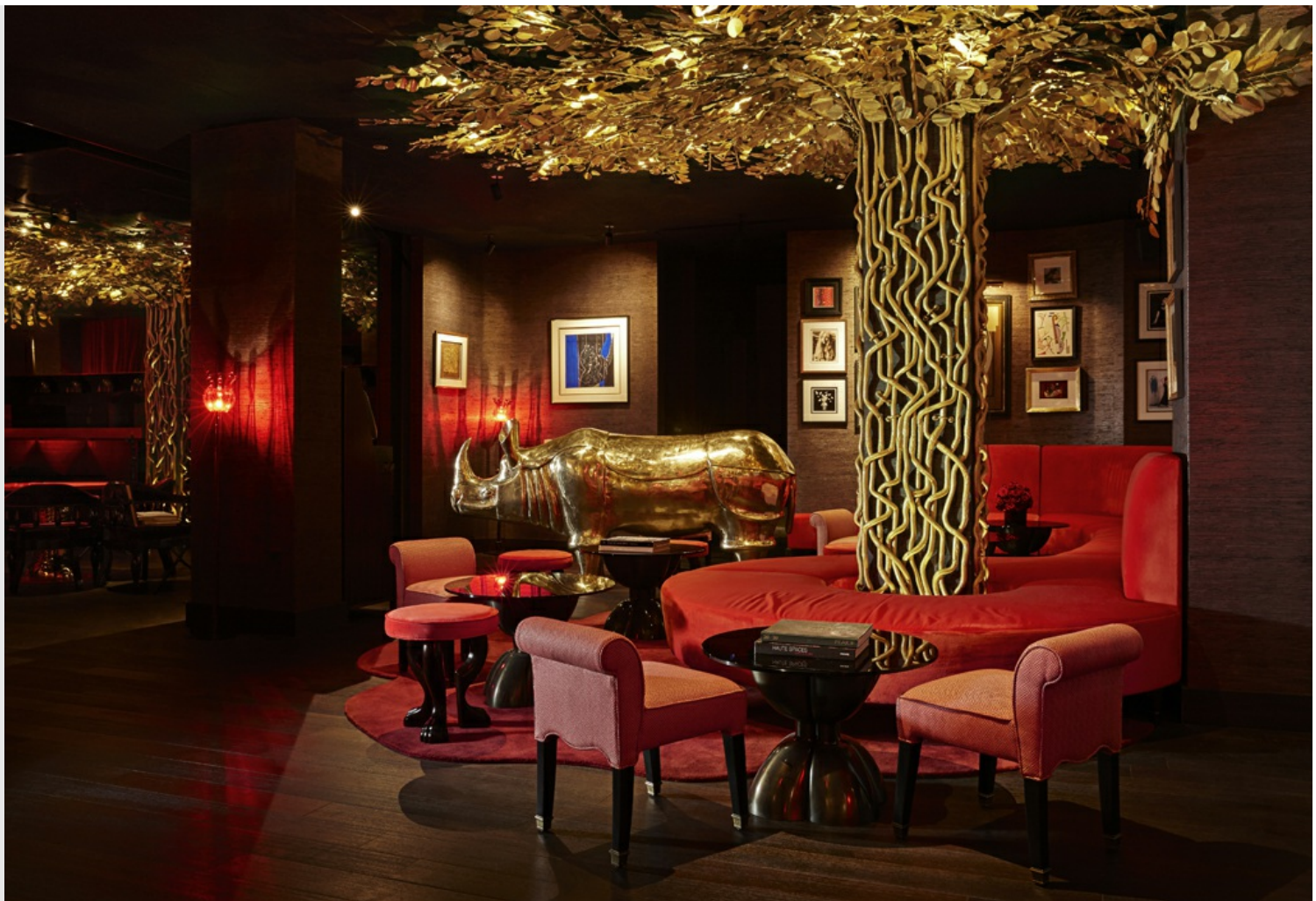
Art meets Eclectic Design at Vagabond Hotel Singapore