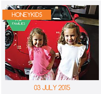
SUMMER DEALS IN SINGAPORE: SCORE