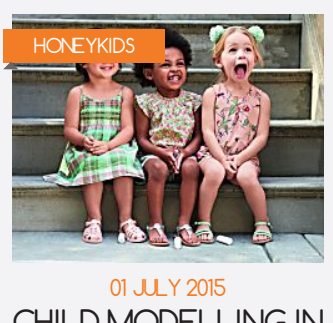
CHILD MODELLING IN SINGAPORE: GAP