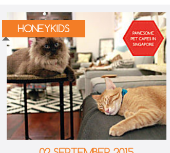
02 SEPTEMBER 2015 CAT AND DOG CAFES IN