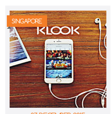
07 DECEMBER 2015 HOLIDAY INSPIRATION!