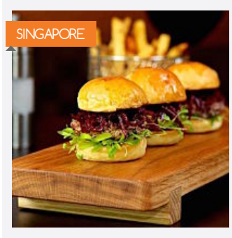
BEST ONE-FOR-ONE DEALS IN