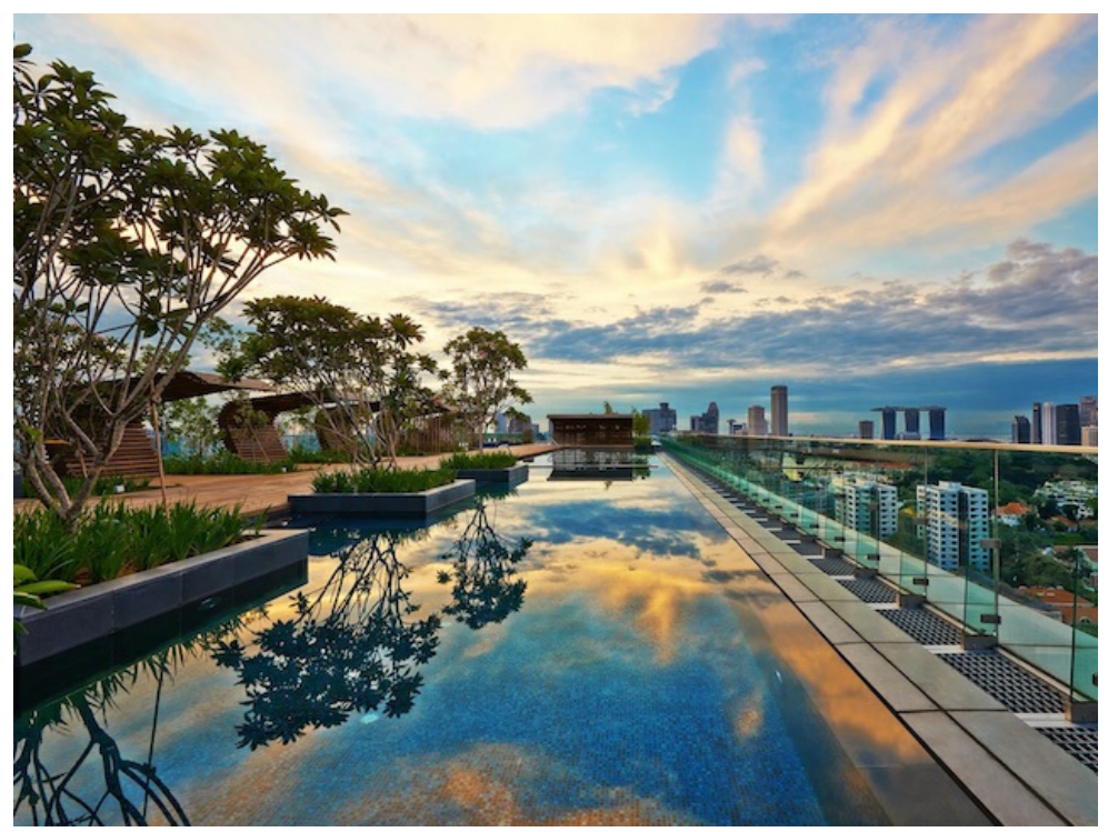
Hotel Jen Orchardgateway Singapore

Need to take a load off and chillax? We've sussed out some of the hottest new hotels at Ann Siang Hill Drchard Road Sentosa and more