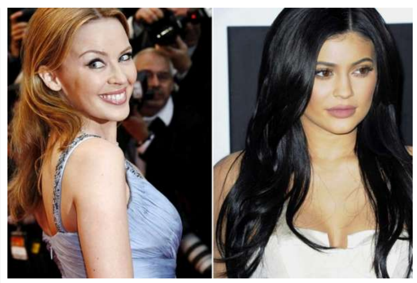
Kylie vs. Kylie: Jenner loses bid to trademark name