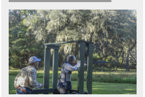
If You Love Fishing, Golfing and Shooting, This Event Is...

Forget your running shoes and swim suits. Participate in a triathlon Brays Island style!