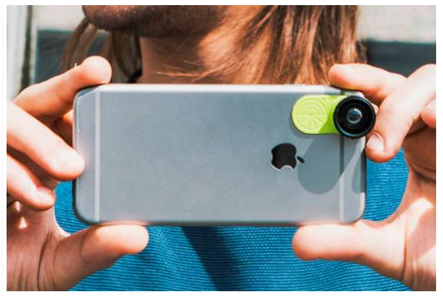
Seriously upgrade your Instagram pics with these mini...