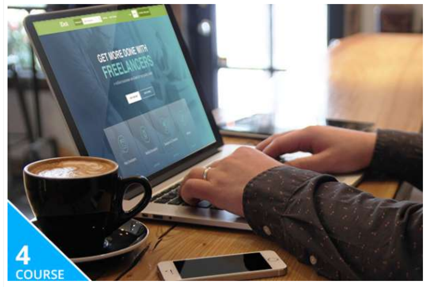
Rev up your business's success with this Productivity Hacks...