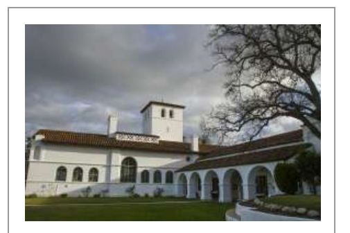
The Hearst Hacienda at Fort Hunter Liggett