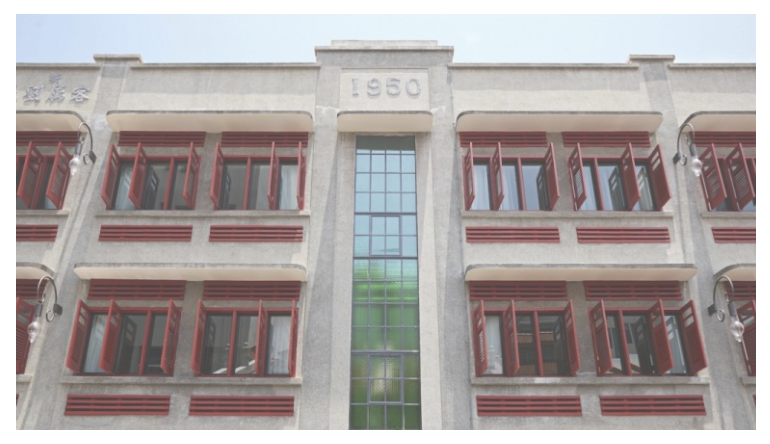
Sandwiched between two of the most colourful and culturally significant heritage areas in Singapore – Little India and

"Its location is a little off the beaten track yet very stimulating and provides a real taste of old Singapore to visitors. Whilst service and amenities are certainly luxurious, we've also worked hard to embed a sense of fun into Vagabond" he adds of the hotel at 39 Syed Alwi Road.