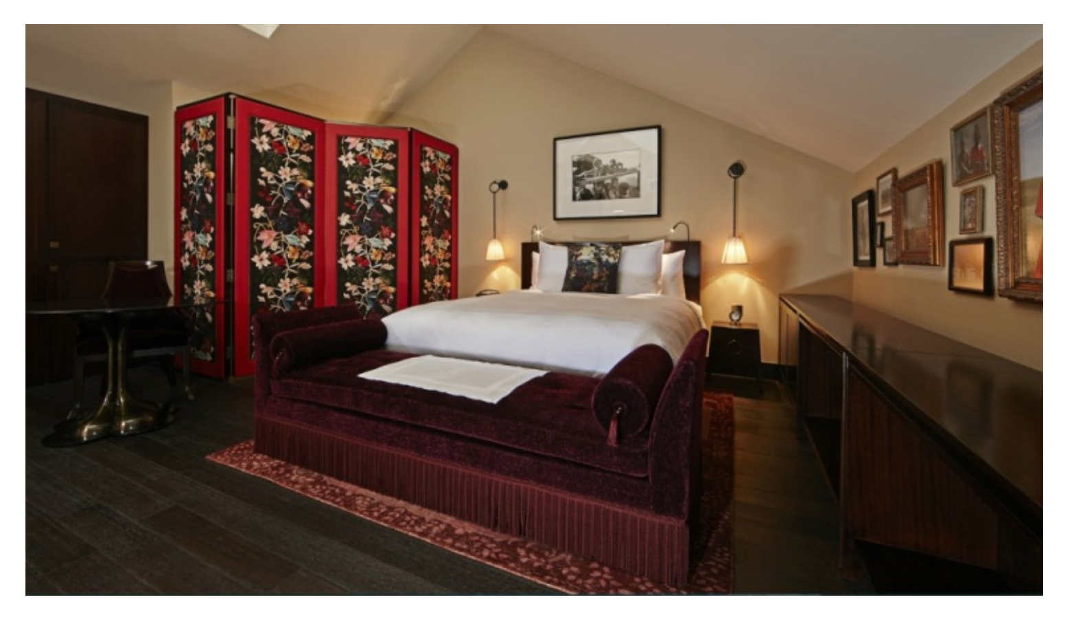
A nondescript 1950s Art Deco building – comprising six adjoining shophouses – on Syed Alwi Road has been transformed into an engrossing 42-room luxury boutique accommodation.

Garcha's original photography – from his international polo team wins, to his world travels – adorn the walls throughout the hotel, including each guest room.