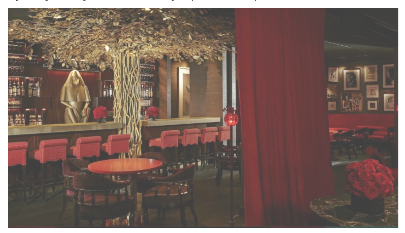
The pillars in the Vagabond Salon are transformed into golden brass banyan trees.

"You may find yourself dining amidst a piece of performance art, sipping artisanal cocktails whilst being entertained by a cutting edge DJ or a jazz quartet, or just chilling out with other guests in the Vagabond Salon. At the same time, you can expect as a given the highest level of Old World hospitality and service," he says.