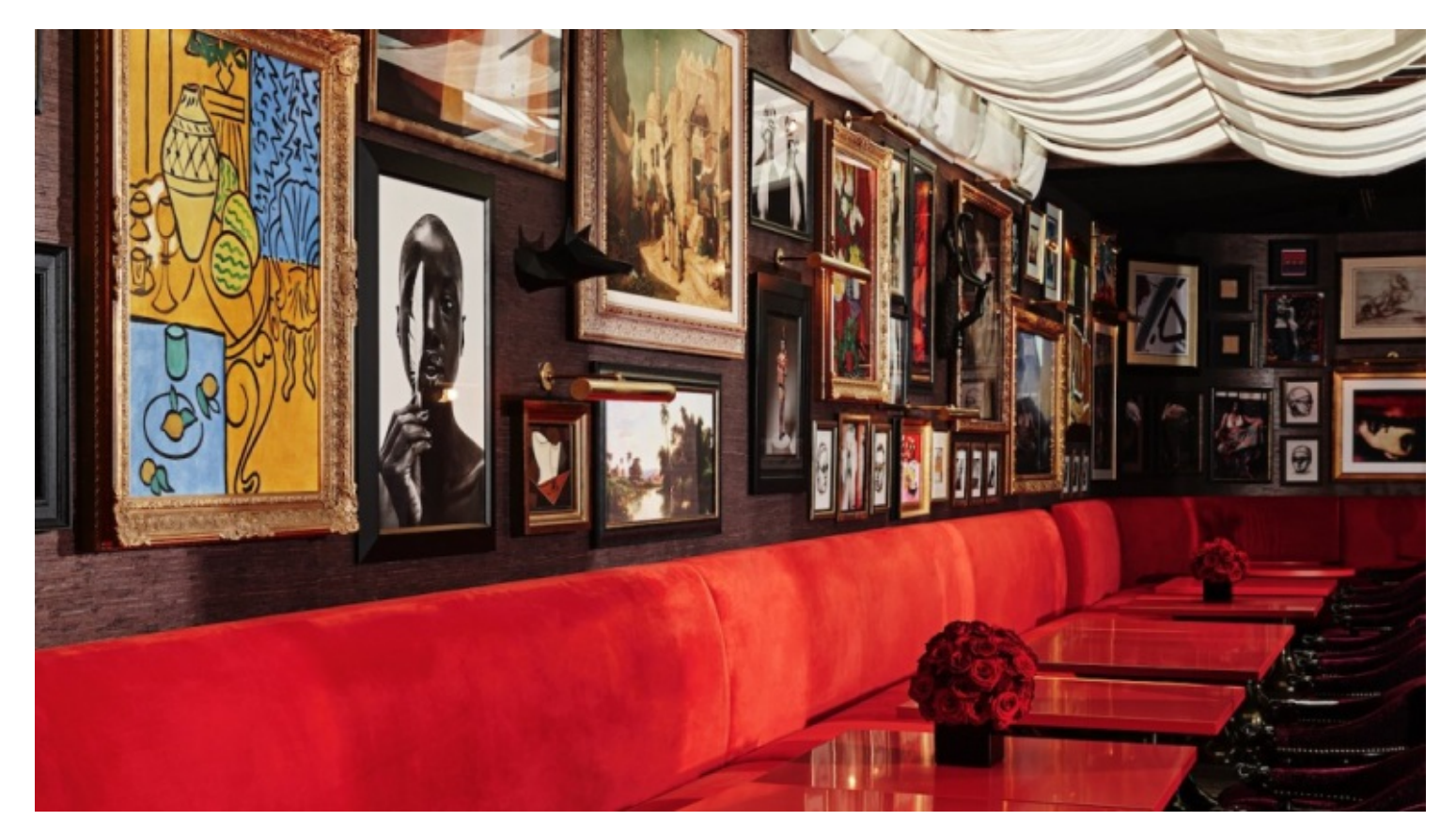
Wall-to-wall curated art pieces.

The mammoth solid brass Rhino-shaped metal reception desk took eight months to create across villages in the northern Indian state of Rajasthan. The family that made it has been crafting armoury for Rajasthani royals for generations.