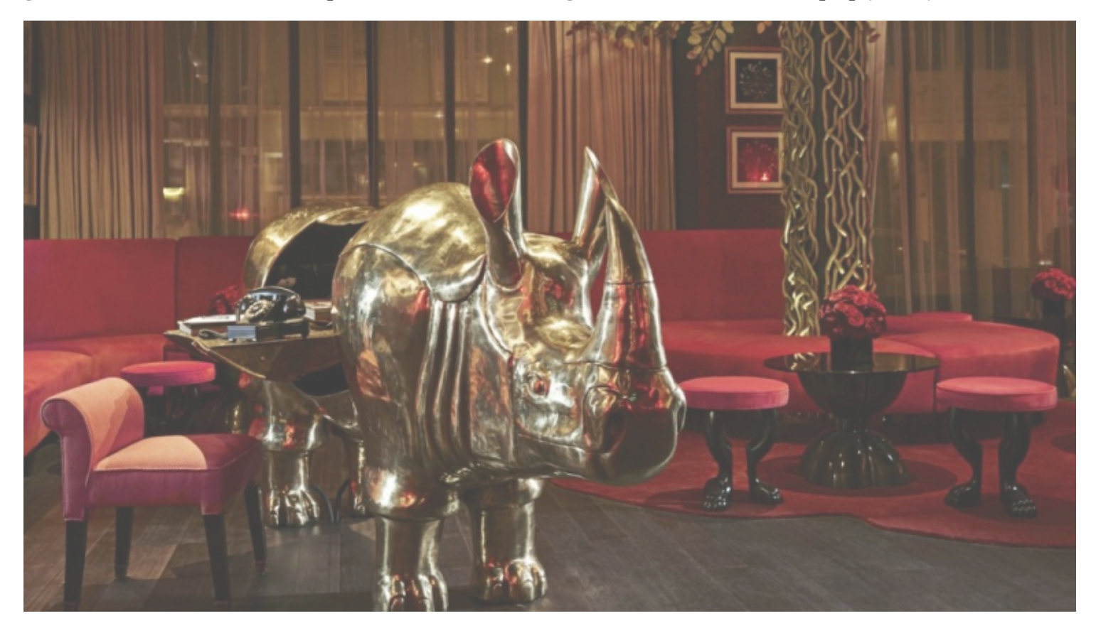
Mammoth bronze rhino-shaped metal reception desk.

Hotel Vagabond doesn't look impressive from the outside. Sandwiched between two of the most colourful and culturally significant heritage areas in Singapore – Little India and Kampong Glam – it is located in a discreet part of town that's slowly but surely becoming trendy. There's no striking hotel marquee and no capacious driveways to drop off or pick up guests. Even the black London taxi parked on the street fronting the hotel looks like a movie prop (it's not).