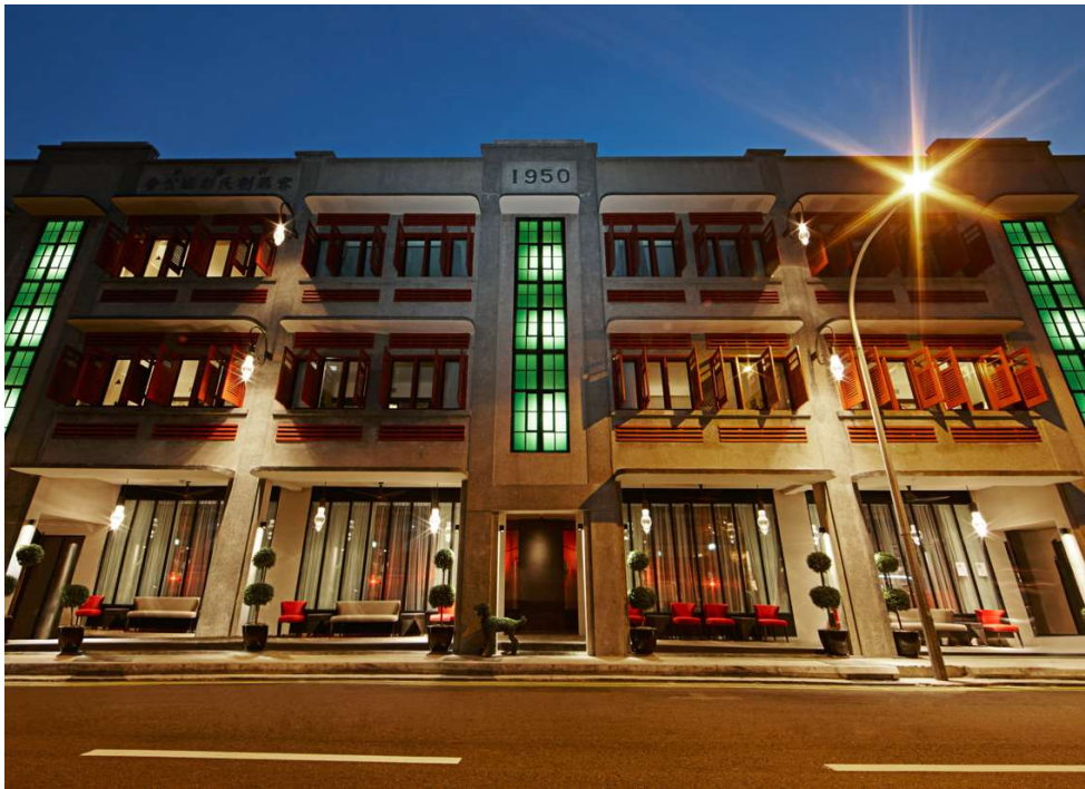
Posted: July 11th, 2016 - Category: Interviews, Voices | Author: Veronica Neo