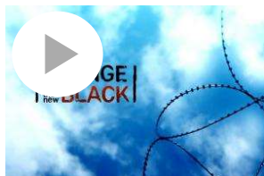
Orange Is the New Black's return date has been confirmed by Netflix