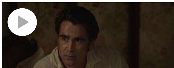
First trailer Sofia Coppola's take on Southern Gothic in The Beguiled