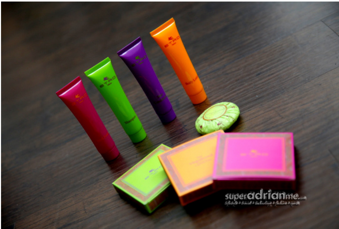
Hotel Vagabond Singapore – Etro Toiletries

You can expect a good sleep with the luxurious Egyptian cotton sheets from Italy and Goose down pillows. You can also watch a selection of in-house films and coffee from the in-room Nespresso coffee machine. Luxuriate in Etro bathroom amenities and smell fabulous.