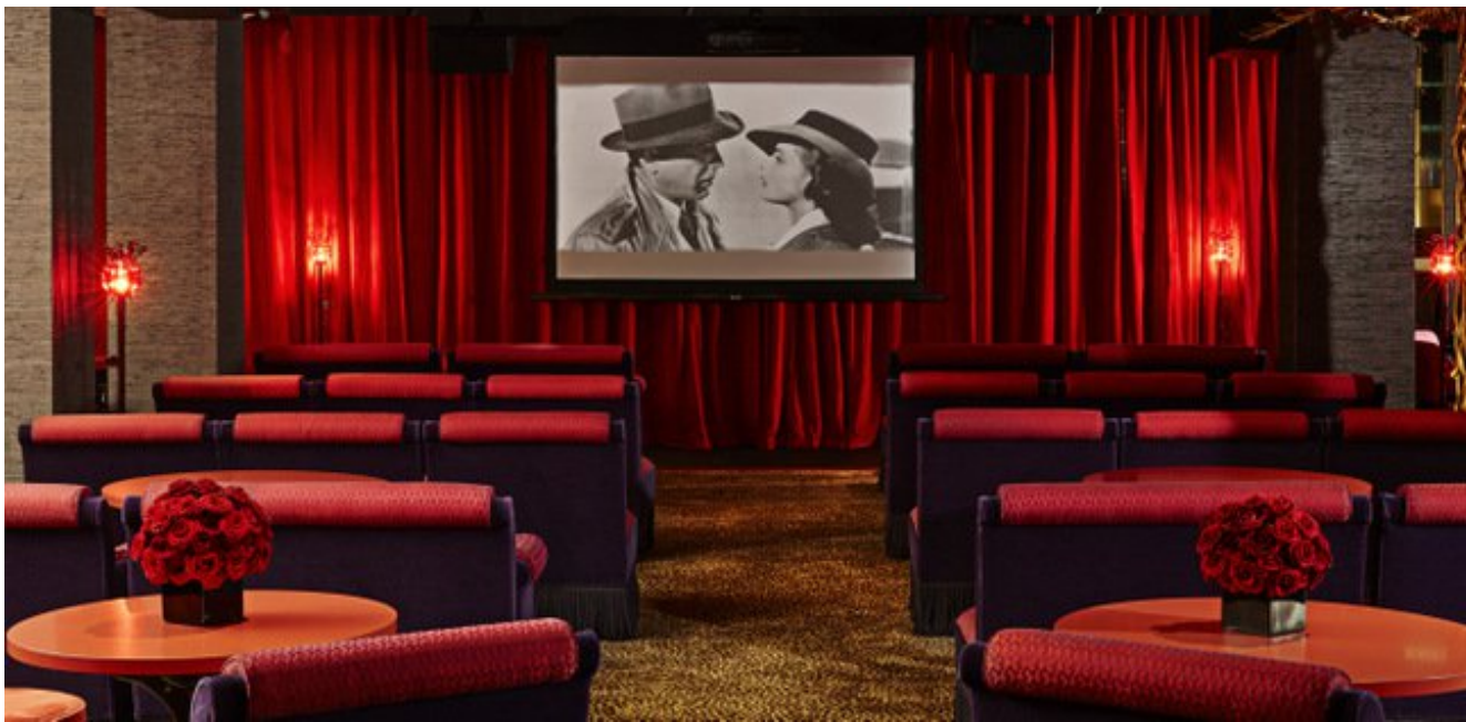
Hotel Vagabond Salon Movie Screening

Guests may mingle with resident artists over cocktails or dine alongside a live fashion show, watch an independent film or listen to a live jazz quartet.