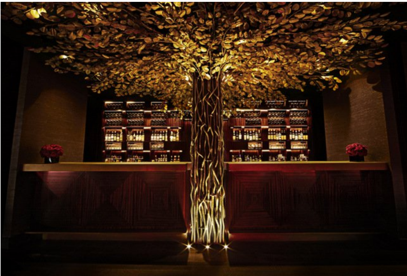
Hotel Vagabond Banyan Tree Sculpture and Bar

Hôtel Vagabond 's Salon opened on Saturday 12 September 2015. The Vagabond Salon is a modern interpretation of a Parisian salon.