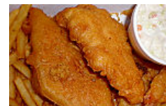
10 Fast Food Items