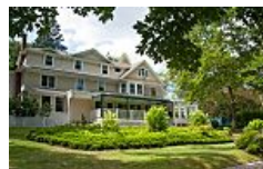
7 Cozy Country Inns