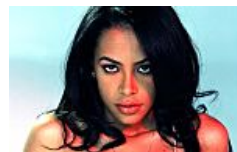
Celebs you didn't