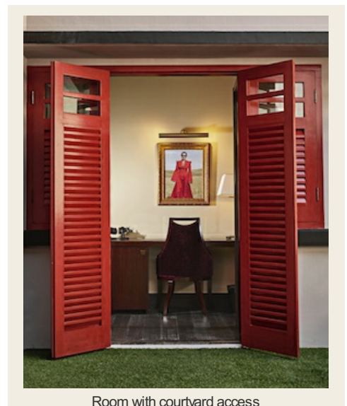
Room with courtyard access

Hotel Vagabond will be the only hotel of its kind in Singapore to offer a rotational Artist in Residence programme. With an emphasis on writing, photography and performance art of all kinds, artists will be invited to apply for residencies of up to three months. Artist Cocktail Hour in the Vagabond Salon will start each evening at 6pm – a time for hotel guests and other Vagabond folk to talk and interact with the artists in residence.