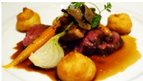
French Flair at Lafite, Kuala Lumpur