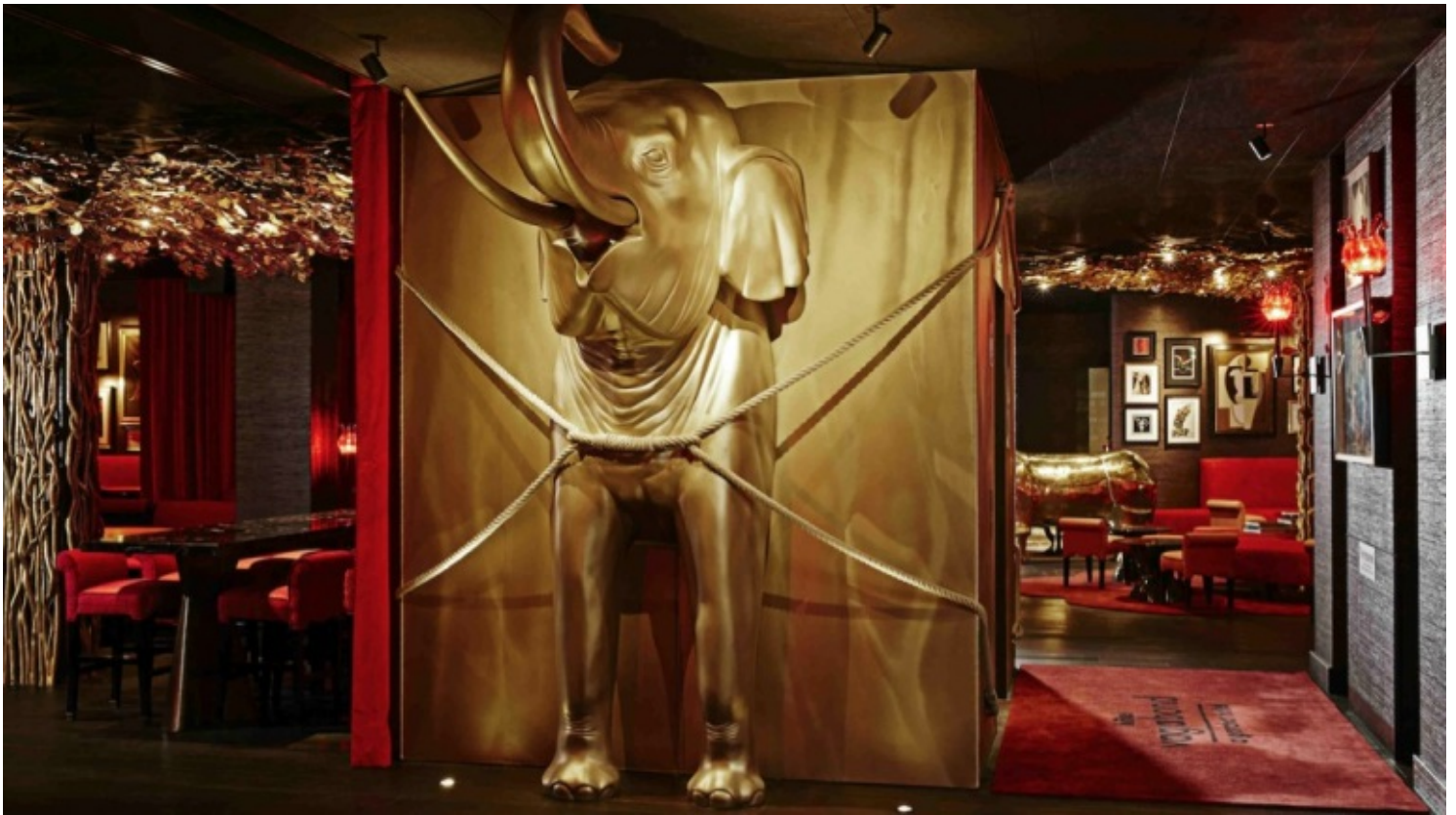
Life-size elephant hoisting up the main elevator