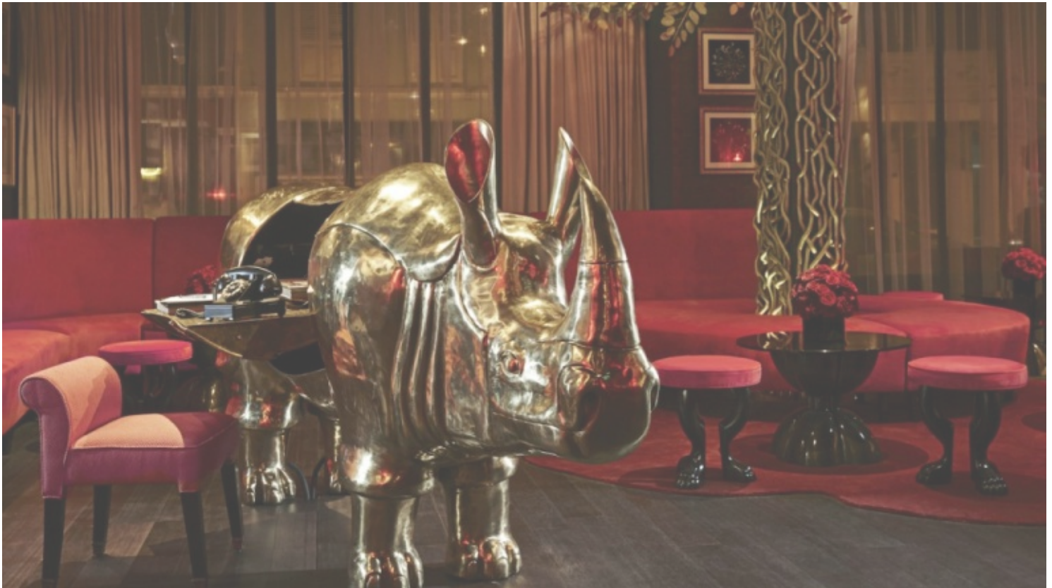
Mammoth bronze rhino-shaped metal reception desk.

Hotel Vagabond doesn't look impressive from the outside. Sandwiched between two of the most colourful and culturally significant heritage areas in Singapore – Little India and Kampong Glam – it is located in a discreet part of town that's slowly but surely becoming trendy. There's no striking hotel marquee and no capacious driveways to drop off or pick up guests. Even the black London taxi parked on the street fronting the hotel looks like a movie prop (it's not).