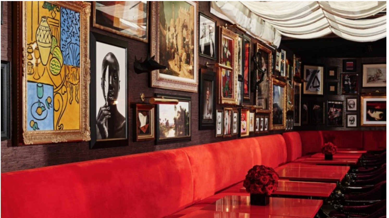
Wall-to-wall curated art pieces.

The mammoth solid brass Rhino-shaped metal reception desk took eight months to create across villages in the northern Indian state of Rajasthan. The family that made it has been crafting armoury for Rajasthani royals for generations.