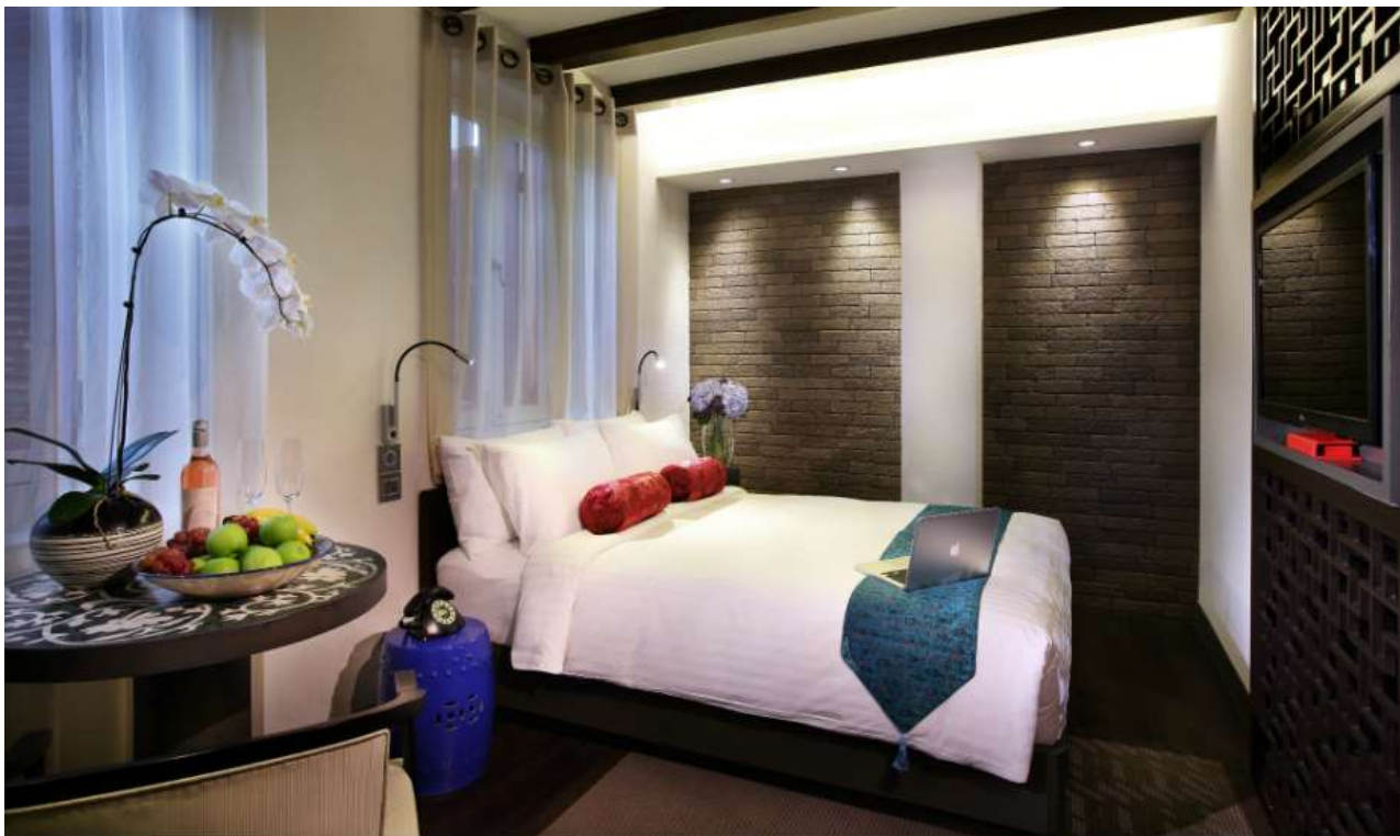
Amoy Hotel - you won't even know you're in the heart of the city

From luxury chic rooms to budget lofts, these stylish boutique hotels boast unforgettable staycays in Keong Saik Road, Robertson Quay, Jalan Besar, Orchard Road and more