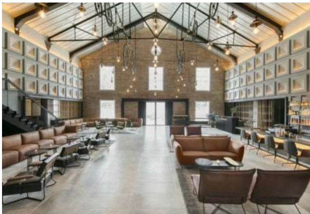
The Warehouse Hotel Has Finally Opened Its Doors