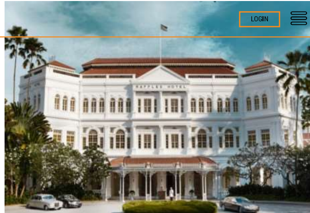
This Grand Historic Hotel Is Turning 130