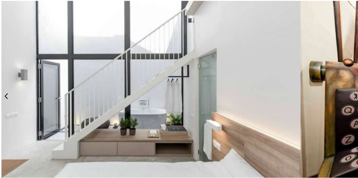
Lloyd's Inn's sleek and minimalist Big Skyroom

Naumi Hotel ( http://www.naumihotel.com/ ), 41 Seah Street, Singapore 188396. Price starts from SGD 350.