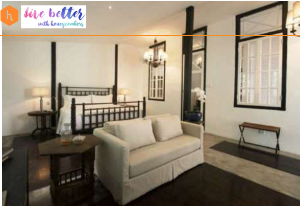
This Staycay Is Like Taking A Trip To Old Malaya