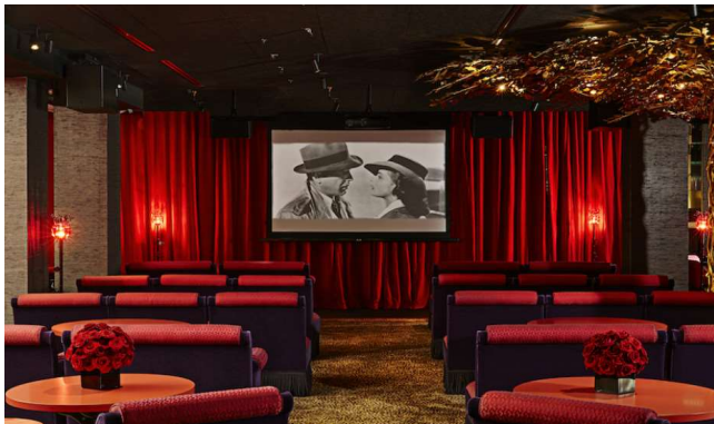
hotel Vagabond offers free movie screenings for its guests

New Majestic Hotel ( http://www.newmajestichotel.com/ ), 31 Bukit Pasoh Road, Singapore 089845, p. 6511 4700. Price: from 209 SGD per night.