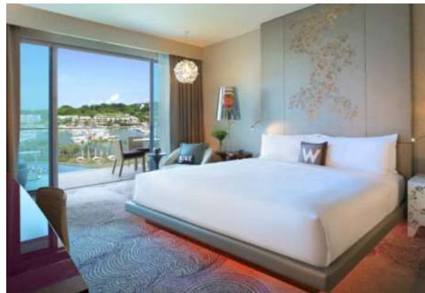
This Staycay Away From The City Can Do No Wrong