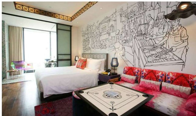
Hotel Indigo celebrates the neighbourhood's heritage in its design

Naumi Liora ( http://thehoneycombers.com/singapore/directory/naumi-liora/ ), 55 Keong Saik Road, Singapore 089158. Price starts from SGD 140.