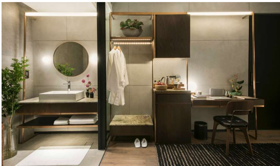
The new Warehouse Hotel is open for reservations from 1 January

Warehouse Hotel ( http://www.thewarehousehotel.com/ ), 320 Havelock Road, Singapore 169628. Price range to be confirmed.